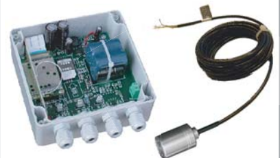
H100-3 telemetry unit